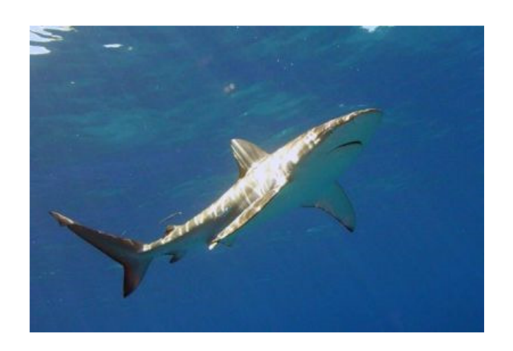
THURSDAY: WOLF ISLAND- DARWIN ISLAND (4 DIVES)